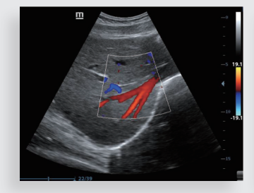
Color Flow of Liver

With powerful user-defined presets, auto image optimization, iWorks (scan protocol), and patient information management system, the Z60 Ultrasound System makes it fast and easy to complete exams. The System also provides onboard reporting and DICOM 3.0 which greatly improves your workflow without compromising diagnostic accuracy.