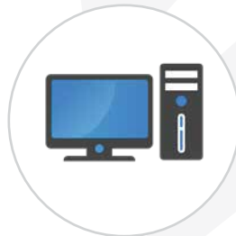
DESKTOP PC / SERVER